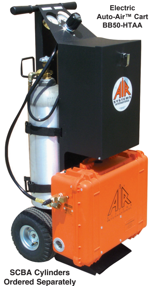
Electric Auto-Air™ Cart BB50-HTAA

Large Cylinder Cart Holds Large Cylinders Cylinders Ordered Separately