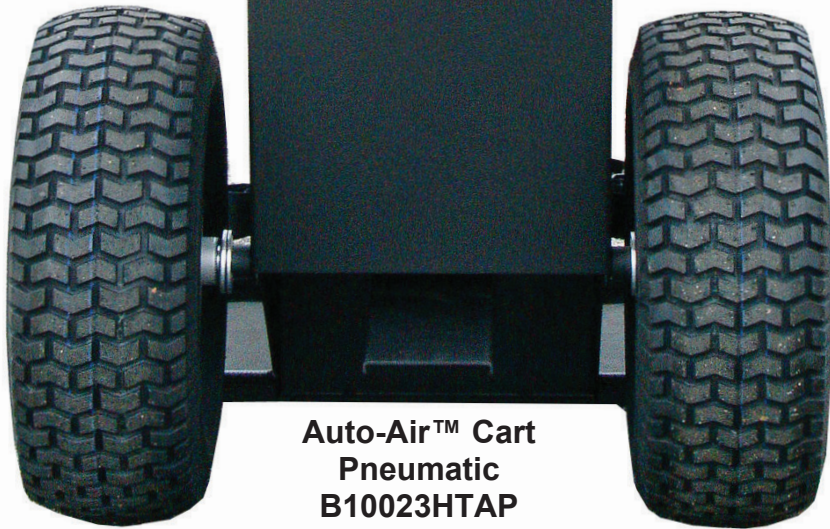
Auto-Air™ Cart Pneumatic B10023HTAP

Large Cylinder Cart Holds Large Cylinders Cylinders Ordered Separately